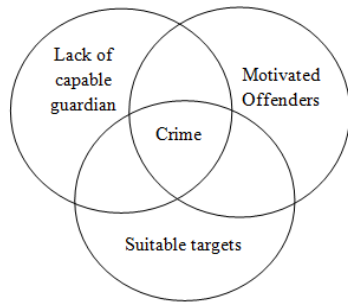
Figure 1. Routine Activities Theory: The Interaction of Three Factors

Source: Teresa, LaGrange (1999). The Impact of Neighborhoods, Schools, and Malls on the Spatial Distribution of Property Damage, Journal of Research in Crime and Delinquency , 36, 393 – 422.